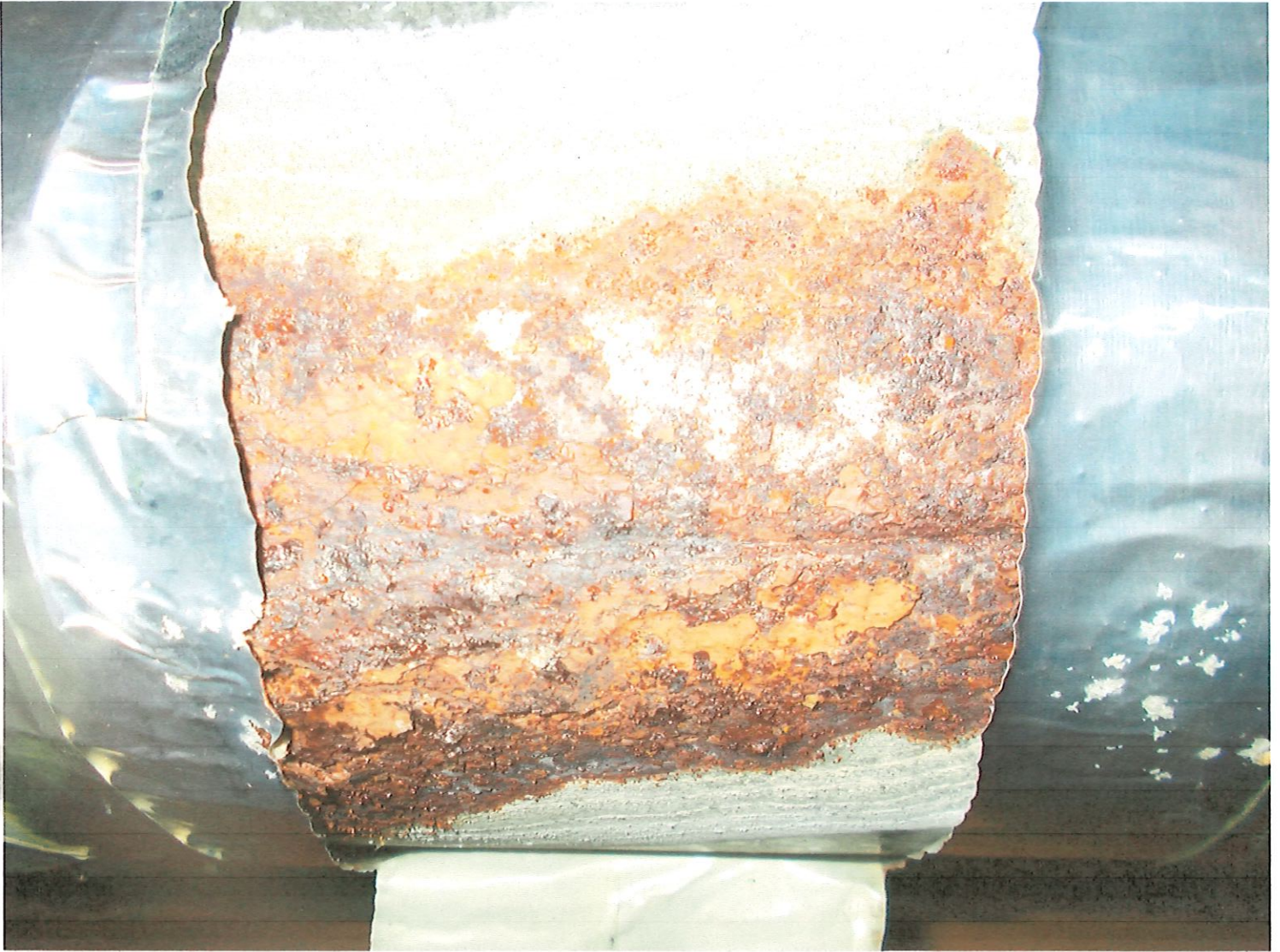
rusted heat pipe with tape removed