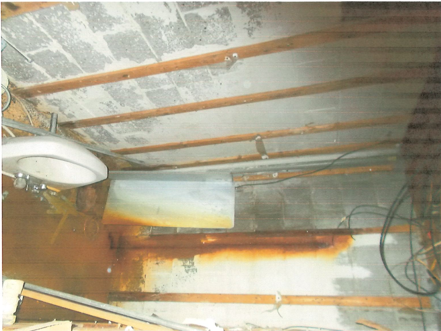
Basement high volume water area