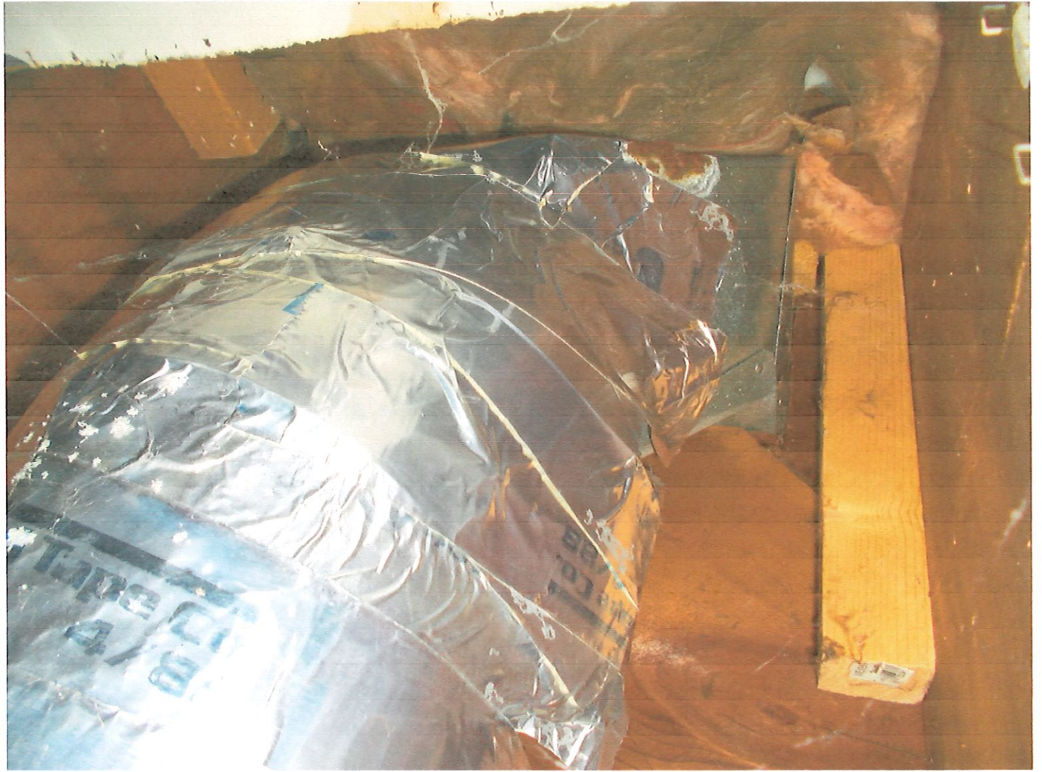
heating pipe held together with tape